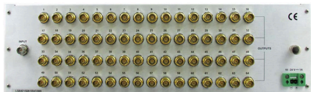
LS64 2150A 64-way Active L-Band Splitter